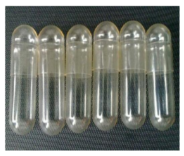
Fig 3. Empty vegetable capsule shell.

as organs of animals, which can be a major downfall for some consumers. Individuals with religious or dietary restrictions which forbid them from consuming such animal products will not be suited for the usage of the traditional gelatin capsules. Another factor to consider when choosing between gelatin and vegetarian capsules is what they are going to be filled with. Gelatin capsules are only suitable for use with powdered medications or supplements. Liquids and various other materials such as gels are not compatible with capsules made of gelatin. One of the most obvious advantages of using cellulose based or vegetarian capsules is that they are not made with animal by products.